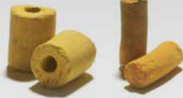
RINGS LP-110 LP-310 Cs-110 PELLETS T-11