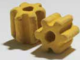
HEXA-LOBED RINGS GR-310 GR-330