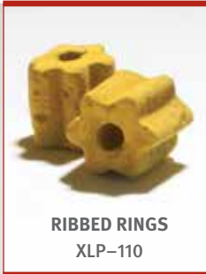
RIBBED RINGS XLP-110 XCs-120 SCX-2000